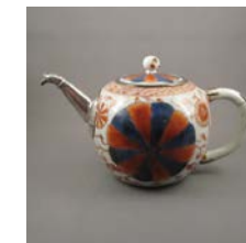
Cat. 16 China for export, teapot, early 18th century with later alteration. Porcelain, silver replacement spout, rim, added metal staples.