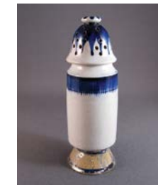
Cat. 60 England, pepper pot, early 19th century with later alteration. Earthenware, painted tin replacement foot.