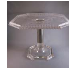
Cat. 14 Bryce Bros. (Pennsylvania), cake stand, c. 1882 with later alteration. Glass, added metal reinforcement.