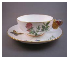
Cat. 99 England, cup, c. 1869 with later alteration. Porcelain, added brass staples.