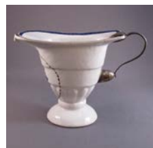
Cat. 53 China for export, helmet-shaped jug, c. 1790s with later alteration. Porcelain, silver replacement handle (recycled spoon).