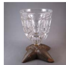
Cat. 107 McKee Bros. (Pennsylvania), goblet, c. 1855 with later alteration. Glass, wood replacement foot.