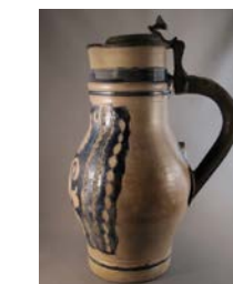
Cat. 66 Carl Wingender (New Jersey) beer pitcher, mid-19th century with later alteration. Stoneware, pewter, metal replacement handle.