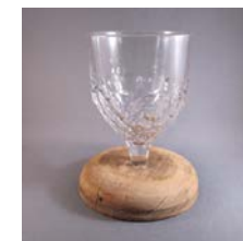
Cat. 108 United States, goblet, c. 1860 with later alteration. Glass, wood replacement foot.