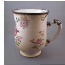
Cat. 79 China for export, mug, c. 1760s with later alteration. Porcelain, added metal bands and rivets.