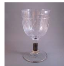
Cat. 110 Richard & Hartley Flint Glass Co. (Pennsylvania), goblet, c. 1880 with later alteration. Glass, brass replacement stem.