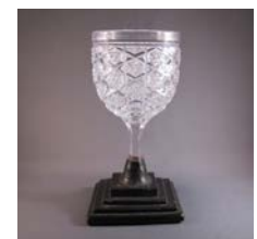
Cat. 112 goblet, c. 1880 with later alteration. Glass, painted wood replacement foot.