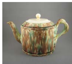
Cat. 27 England, teapot, c. 1780 with later alteration. Earthenware, earthenware replacement lid, silver reinforcement (inner rim).