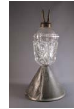
Cat. 125 Boston and Sandwich Glass Co. (Massachusetts), oil lamp, c. 1840s with later alteration. Glass, brass burner (probably replacement), tin replacement foot.