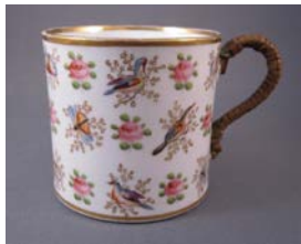
Cat. 92 England, coffee cup, c. 1815 with later alteration. Porcelain, bronze and rattan replacement handle.