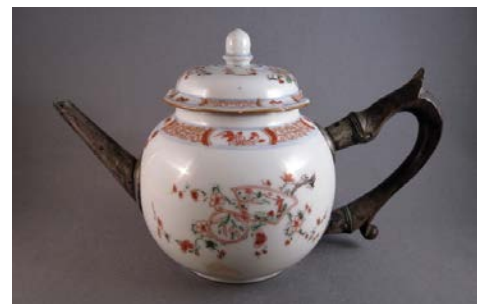
Fig. 3 China for export, teapot mid-18th century with later alteration. Porcelain, silver replacement spout, wood replacement handle. Collection of Andrew Baseman