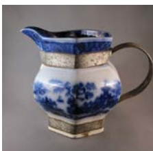
Cat. 62 England, jug, early 19th century with later alteration. Ironstone, metal replacement handle, bands.