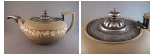
Cat. 37 Wedgwood & Co. (England), teapot, early 19th century with later alteration. Stoneware, silverplated replacement spout and lid.