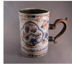
Cat. 77 China for export, mug, c. 1700 with later alteration. Porcelain, wood and metal replacement handle, added zinc liner.