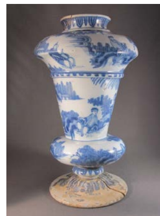
Fig. 11 The Netherlands, vase, c. 1680s with later alteration. Earthenware with wooden replacement foot. Collection of Andrew Baseman