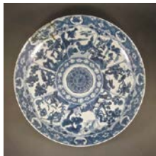
Cat. 1 China for export, dish, c. 1700 with later alteration. Porcelain, added wire, replacement porcelain (mismatched patch).