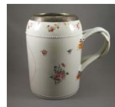
Cat. 86 China for export, mug, c. 1785 with later alteration. Porcelain, silver replacement rim.