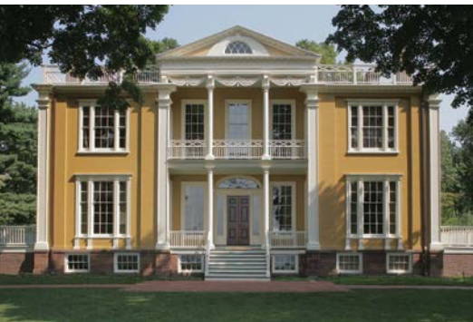
Fig. 1 Boscobel House and Gardens, as restored in Garrison, New York