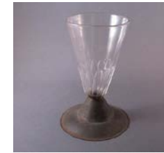
Cat. 102 England, goblet, c. 1790 with later alteration. Glass, tin replacement foot.