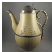
Cat. 31 Samuel Hollins (England) coffee pot, c. 1800 with later alteration. Stoneware, metal replacement spout, lid.