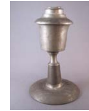
Cat. 126 United States, oil lamp, c. 1830s with later alteration. Pewter, tin replacement foot (missing burner).