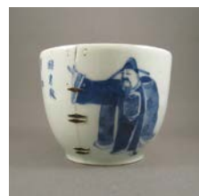
Cat. 100 China for export, cup, c. 1870 with later alteration. Porcelain, metal staples.