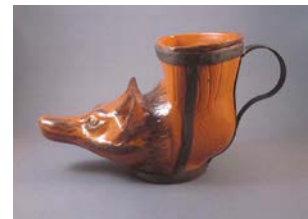
Cat. 85 England, stirrup cup, c. 1770s with later alteration. Earthenware, metal replacement handle, bands.