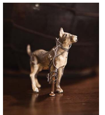
Fig. 4 France, dog figurine, 1930s with later alteration. Lead with iron and wire replacement leg. Collection of Andrew Baseman