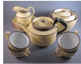
Cat. 118 England, miniature tea set, c. 1820 with later alteration. Earthenware, metal replacement handle, bands (teapot).