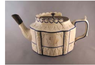
Cat. 34 England, teapot, c. 1810s with later alteration. Stoneware, bronze replacement spout, brass replacement lid, metal staples.