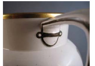
Figs. 3–4 Swansea (Wales), jug, c. 1810 with later alteration. Porcelain with brass replacement spout. Collection of Andrew Baseman