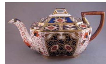
Cat. 42 Wedgwood (England), teapot, c. 1880 with later alteration. Porcelain, wood replacement handle.