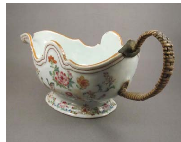
Fig. 12 China for export, sauceboat, c. 1760 with later alteration. Porcelain with metal and rattan replacement handle. Collection of Andrew Baseman