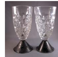
Cat. 105 United States, pair of goblets, c. 1840 with later alteration. Glass, iron and lead replacement feet.