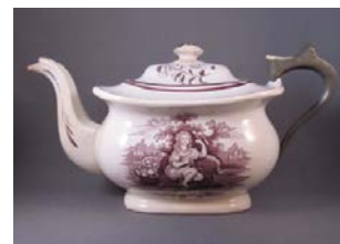
Cat. 39 England, teapot, early 19th century with later alteration. Earthenware, pewter replacement handle.