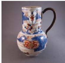
Cat. 44 China for export, cruet jug, c. 1710 with later alteration. Porcelain, bronze and rattan replacement handle.