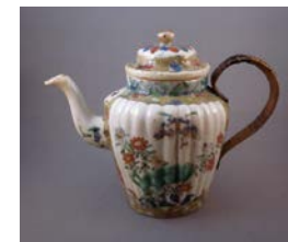
Cat. 15 China for export, teapot, c. 1690 with later alteration. Porcelain, rattan and metal replacement handle, staples.