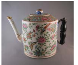
Cat. 38 China for export, teapot, c. 1820s with later alteration. Porcelain, wood and wire replacement handle.