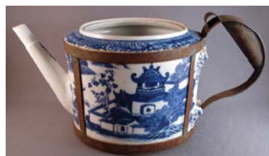
Cat. 32 China for export, teapot, c. 1800 with later alteration. Porcelain, metal replacement handle, bands.