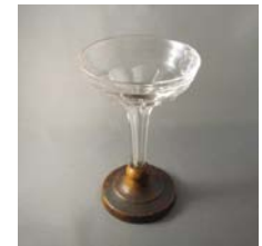
Cat. 106 United States, champagne glass, c. 1850 with later alteration. Glass, wood replacement foot.