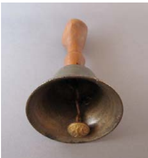
Figs. 7-8 Possibly United States, bell, c. 1900 with later alteration. Brass with wooden replacement handle, brass replacement clapper. Collection of Andrew Baseman