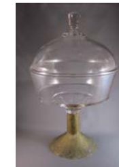
Cat. 13 United States, compote, c. 1870 with later alteration. Glass, painted metal replacement foot.