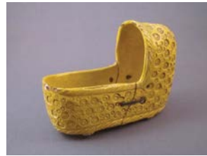
Cat. 117 England, miniature cradle, c. 1820 with later alteration. Earthenware, added metal staples.