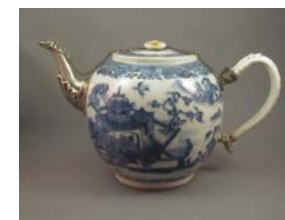
Cat. 18 China for export, teapot, c. 1750 with later alteration. Porcelain, silver replacement spout, added metal mounts and chain.