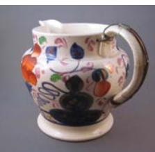
Cat. 64 England or Wales, jug, c. 1830s with later alteration. Earthenware, added wire reinforcements, rivets.