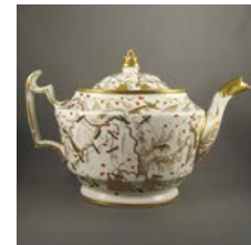
Cat. 36 Coalport (England), teapot, c. 1812 with later alteration. Porcelain, added metal staples.