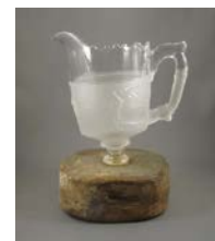
Cat. 76 Gillander & Sons (Pennsylvania), "Westward Ho" jug, c. 1879 with later alteration. Glass, wood replacement foot.