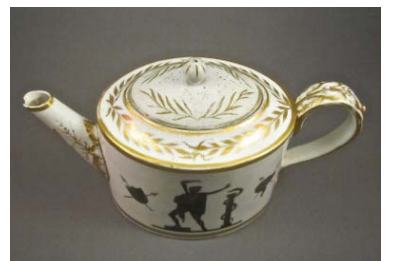
Figs. 5–6 Derby (England), teapot, c. 1790 with later alteration. Porcelain, metal replacement lid. Collection of Andrew Baseman