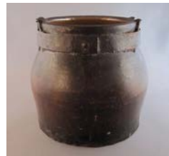
Cat. 137 United States, pot, c. 1850s with later alteration. Earthenware, added metal band, nails.