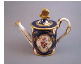
Cat. 121 Davenport (England), miniature watering can, c. 1860s with later alteration. Porcelain, added brass staples.