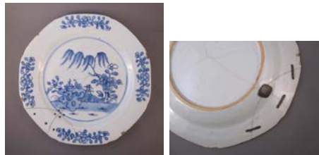
Cat. 2 China for export, plate, early 18th century with later alteration. Porcelain, iron staples, pewter plug.