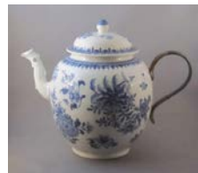
Cat. 47 China for export, punch pot, c. 1760 with later alteration. Porcelain, gilded metal and rattan replacement handle.