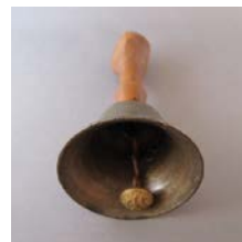
Cat. 143 United States, bell, c. 1900 with later alteration. Brass, wooden replacement handle, replacement clapper (recycled Civil War uniform button).