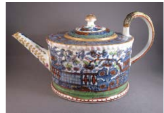
Cat. 24 China for export, "clobbered" teapot, c. 1780s with later alteration. Porcelain, overpainted, added staples, lead band.