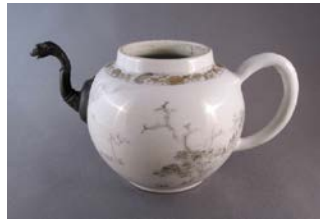
Cat. 21 China for export, teapot, c. 1750s with later alteration. Porcelain, bronze replacement spout.