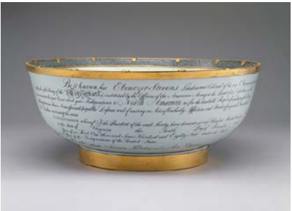
Fig. 16 China for Export, Ebenezer Stevens punchbowl, c. 1786-90 with later alteration. Porcelain with added silver-gilt supports. Courtesy of Metropolitan Museum of Art; Gift of Lucille S. Pfeffer, 1984

The table's underside reveals many different repairs, including iron braces and a replaced tilt-top mechanism. Although not meant to be seen when in use, the table's repairs are just as telling of its importance to Cochran's descendants.