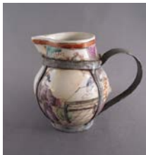
Cat. 49 China for export, jug, late 18th century with later alteration. Porcelain, painted metal replacement handle, band.