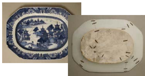
Cat. 5 China for export, platter, c. 1770 with later alteration. Porcelain, added metal staples.