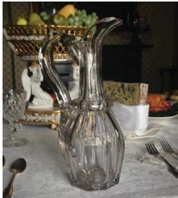
Fig. 19 Possibly Waterford (Ireland), pitcher, c. 1825 with later alteration. Glass with added metal staples. Historic Hudson Valley. Pocantico Hills, NY