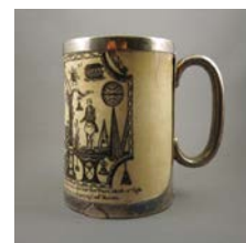
Cat 88 Herculaneum Pottery (England), Masonic mug, c. 1800 with later alteration. Earthenware, silver replacement rim, foot, and handle.