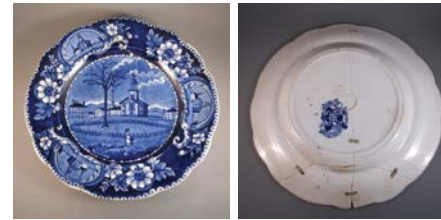
Cat. 10 James and Ralph Clews (England), "Pittsfield Elm" plate, early 19th century with later alteration. Earthenware, added metal staples.