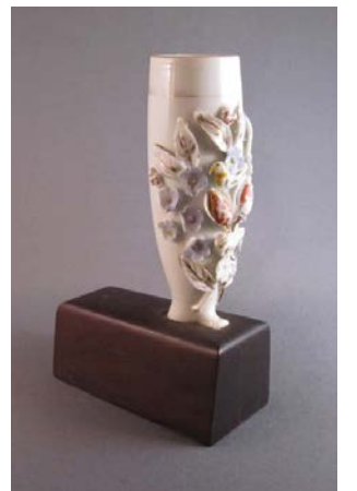
Fig. 2 Probably Germany, bud vase/tobacco pipe, late 19th century with later alteration. Porcelain with added wood base. Collection of Andrew Baseman

Considering that the vast quantity and variety of 17 th to 19 th -century household items were made of glass, pottery, and porcelain, it seems impossible that any survived intact. The fragility of antique toys is particularly astounding. Commonplace playthings for children included miniature china tea sets, glass coin banks, and bisque dolls, all of which demanded careful handling. Even cast iron toys, popular from the late 19 th century into the mid-20 th , broke easily when handled too roughly. One of the most poignant repairs I have is a 1930s lead dog figurine with a simple carpenter's nail wrapped with wire standing in as a fourth leg (fig. 4). I am