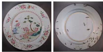
Cat. 4 China for export, charger, c. 1730 with later alteration. Porcelain, added metal staples.