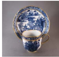
Cat. 91 China for export, cup and saucer c. 1810 with later alteration. Porcelain, bronze and rattan replacement handle.