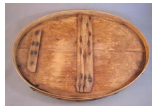
Cat. 142 United States box lid, c. 1890s with later alteration. Wood, wood and metal reinforcement.