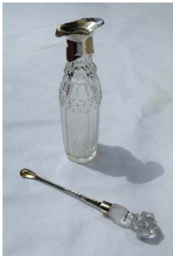
Figs. 14–15 Ireland (glass) and Christopher Haines (silversmith, Dublin). Epergne, 1785 with later cruet bottle. Silver and cut glass. Boscobel House and Gardens

Many make-do's find safety in numbers. A vase that was part of a three- or five-piece garniture (fig. 11) was more likely to be repaired to preserve the set. Retaining the parts of unified sets became even more imperative after large, matching porcelain dinner services came into fashion in the mid-18 th century. China exported enormous quantities of porcelain to the West for dinner services, which often numbered in the hundreds of pieces. Forms such as sauceboats—totally foreign to the Chinese—were based on European silver versions. Their looped handles were stable enough in silver, but proved too weak in porcelain, particularly vulnerable when shipped or handled. Damaged sauceboats were prescribed the standardized treatment developed for teapots, which suffer the same affliction: metal replacement handles, attached with rivets, and wrapped with rattan to make them more pleasing to the eye and hand (fig. 12).