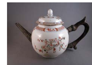
Cat. 19 China for export, teapot, mid-18th century with later alteration. Porcelain, silver replacement spout, wood replacement handle.