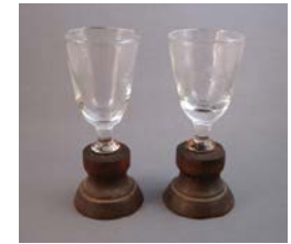
Cat. 103 Pair of goblets, c. 1790 with later alteration. Glass, wood replacement feet.