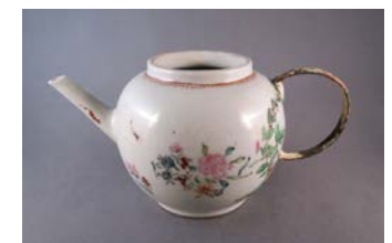
Cat. 20 China for export, teapot, mid-18th century with later alteration. Porcelain, painted metal replacement handle.