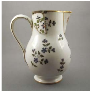
Fig. 13 Fabrique de la Reine (Paris), Jug, c. 1778 with later alteration. Porcelain with added porcelain and metal staples. Collection of Andrew Baseman