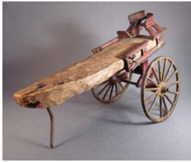
Fig. 5 United States, fragment from a fire ladder wagon, c. 1900 with later alteration. Cast iron with wood and metal replacement parts. Collection of Andrew Baseman

also quite fond of a simple pull toy consisting of a pair of iron wheels mounted to a plank of wood pulled by a string (fig. 5). In researching what the completed toy looked like before it broke and parts went missing, I discovered I had a small fraction of an elaborate cast iron horse-drawn ladder wagon, which originally consisted of a long cart, two pair of wheels, three horses, two firemen, four ladders, and a bell. I trust that the child who pulled the broken fragments mounted to the piece of wood had a good imagination.