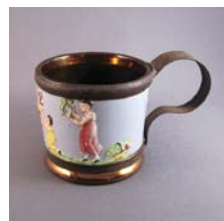
Cat. 95 England, cup, c. 1840s with later alteration. Earthenware, metal replacement handle, bands.