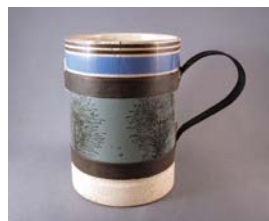
Cat. 96 England, mug, c. 1850 with later alteration. Earthenware, metal replacement handle, bands.