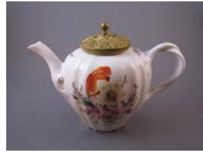
Cat. 114 Meissen Porcelain Manufactory (Germany), miniature teapot, c. 1750 with later alteration. Porcelain, brass replacement lid (recycled).