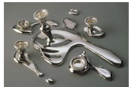
Fig. 23 Myra Mimlitsch-Gray, (New Paltz, NY) Seven Fragments , 2003. Silver. Collection of the Cranbrook Art Museum (CAM 2003.6) ©Myra Mimlitsch-Gray