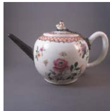
Cat. 25 China for export, teapot, late 18th century with later alteration. Porcelain, metal replacement spout, added chain.