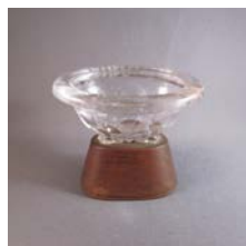
Cat. 74 United States, salt cellar, c. 1860 with later alteration. Glass, wood replacement foot.