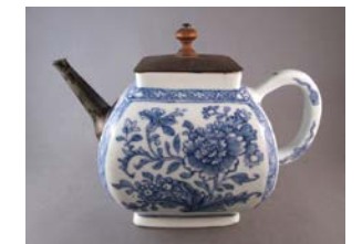
Cat. 17 China for export, teapot, c. 1730 with later alteration. Porcelain, silver replacement spout, tin replacement lid, wood finial.