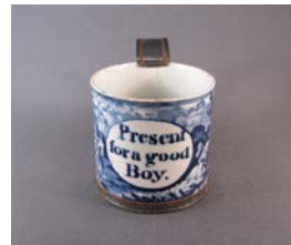
Cat. 94 England, "Present" mug, mid-19th century with 21st-century repair by unknown Eastfield Village (East Nassau, NY) student. Earthenware, metal replacement handle, foot.