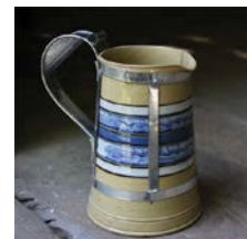
Cat. 67 England, jug, mid-19th century with 2010 alterations by Don Carpentier at Eastfield Village, NY. Earthenware, tin replacement handle, bands.