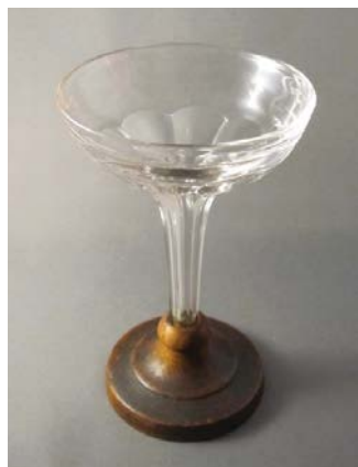
Fig. 20 Champagne glass, c. 1850 with later alteration. Glass with wooden replacement base. Collection of Andrew Baseman