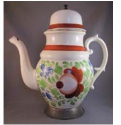
Cat. 35 England, "King Rose" coffee pot, c. 1810s with later alteration Earthenware, metal replacement foot, possibly replacement lid, replacement finial.