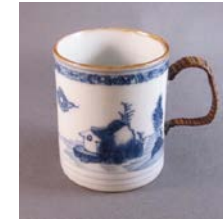
Cat. 78 China for export, mug, c. 1750 with later alteration. Porcelain, metal and rattan replacement handle.