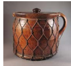
Cat. 138 Pennsylvania, crock, c. 1870 with later alteration. Earthenware, added wire reinforcement.