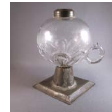
Cat. 132 United States, oil lamp, c. 1875 with later alteration. Glass, brass, metal replacement base (missing burner).