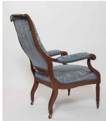
Cat. 135 J. Werner (New York), pair of armchairs, c. 1840 with later alteration. Mahogany, modern silk upholstery, brass, added iron reinforcement. Collection of Bard College, Montgomery Place Campus