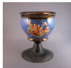
Cat. 97 England, goblet, c. 1860 with later alteration. Earthenware, metal replacement foot.