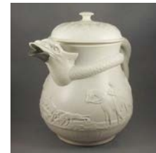
Cat. 59 Chrysanthemum Factory (England), jug, c. 1810s with later alteration. Stoneware, silver replacement spout (mismatched lid).