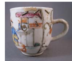
Cat. 80 China for export, cup, c. 1760s with later alteration. Porcelain, added metal staples.