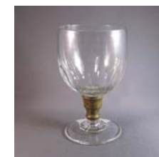
Cat. 111 United States, goblet, c. 1880 with later alteration. Glass, brass replacement stem (recycled lamp ferrule), replaced glass foot.