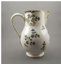
Cat. 52 Paris, "cornflower" jug, c. 1780s with later alteration. Porcelain, replacement porcelain, wire.