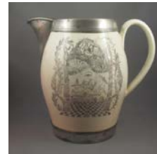
Cat. 56 England, Masonic jug, c. 1800 with later alteration. Earthenware, metal replacement spout, rim, and foot.