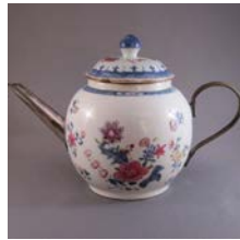
Cat. 22 China for export, teapot, c. 1770s with later alteration. Porcelain, silver replacement spout, possibly a replacement lid, metal reinforcement (inside lid), brass replacement handle.