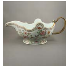
Cat. 48 China for export, sauceboat, c. 1760s with later alteration. Porcelain, metal and rattan replacement handle.