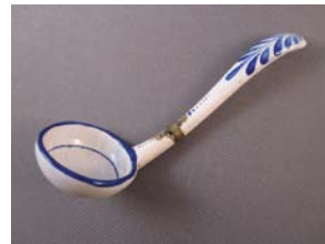
Cat. 120 Probably England, miniature ladle, c. 1840s with later alteration. Earthenware, added brass wire.