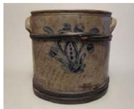
Cat. 141 New England, crock, c. 1880 with later alteration. Stoneware, added willow bands.