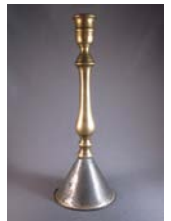
Cat. 133 Candlestick, late 19th century with later alteration. Brass, metal replacement foot.