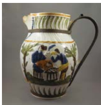
Cat. 55 England, "Slaughter Feast" jug, c. 1795 with later alteration. Earthenware, metal replacement handle and band.