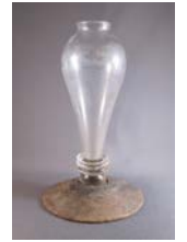
Cat. 127 United States, oil lamp, c. 1830 with later alteration. Glass, wood replacement base (missing burner).