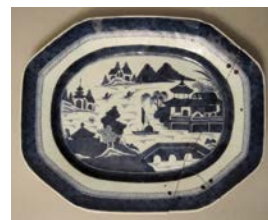
Cat. 9 China for export, platter, c. 1820s with later alteration. Porcelain, added metal bands, rivets.