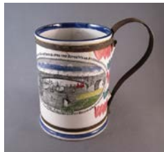
Cat. 93 Samuel Moore & Co. (England), "Bridge" mug, c. 1830s with later alteration. Earthenware, metal replacement handle, bands.