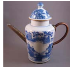
Cat. 33 China for export, Coffee or chocolate pot, c. 1800 with later alteration. Porcelain, silver replacement spout, tin reinforcement (inside lid), bronze and rattan handle.