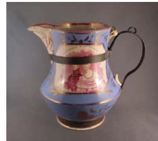
Fig. 10 England, “Victoria and Albert” commemorative jug, c. 1840 with later alteration. Earthenware with metal replacement handle, band. Collection of Andrew Baseman

Some make-do repairs seem almost designed to fight, rather than complement, the object’s original decoration. Such is the case with a late 19 th -century jug with angel decoration (fig. 9). The replacement handle, originally cast for a pewter example, is mounted with wide bands that completely obscure the figures. The jug, itself a poor man’s imitation of Wedgwood jasperware, was probably intended more for show than practicality (its weight is ill-balanced for pouring). One can’t help but wonder what the owner thought when faced with the pewterer’s overly elaborate, unnecessarily intrusive repair. There is a particular kind of satisfaction in engineering a solution with parts on hand. That may have been successful enough for the pewterer, if not the client. The repair band on a jug commemorating the marriage of Queen Victoria and Prince Albert appears somehow more whimsical (fig. 10), as well as more considerate of the original object. In spite of its defacement, the jug’s condition suggests that it was never banished from the parlor for heavy use below stairs. Perhaps both tinsmith and owner enjoyed the comical result.