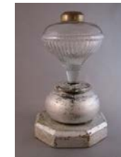
Cat. 131 United States, oil lamp, c. 1870 with later alteration. Glass, brass, painted wood replacement foot (missing burner).