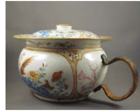
Cat. 115 China for export, chamber pot, c. 1770 with later alteration. Porcelain, metal and rattan replacement handle.