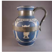
Cat. 69 Dudson (England), jug with angels, c. 1870s with later alteration. Stoneware, pewter replacement handle, bands.