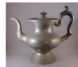
Cat. 43 England or United States, teapot, mid 19th century with later alteration. Pewter, wood, tin replacement foot.