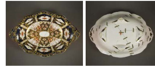
Cat. 12 Royal Crown Derby (England), dish, c. 1905 with later alteration. Porcelain, added metal staples.