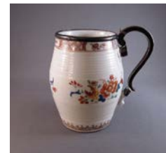
Cat. 83 China for export, mug, c. 1770 with later alteration. Porcelain, silver rim reinforcement, replacement handle.