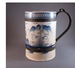
Cat. 87 England, mug, c. 1790 with later alteration. Earthenware, metal replacement handle, bands.