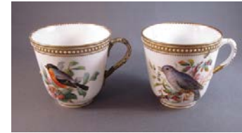
Cat. 101 Royal Worcester (England), pair of cups, c. 1875 with later alteration. Porcelain, painted metal replacement handle, staples.