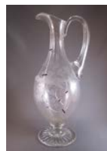
Cat. 75 England, champagne jug, c. 1860s with later alteration. Glass, added metal staples.