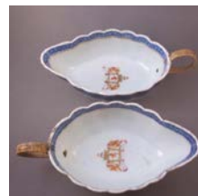
Cat. 54 China for export, pair of sauceboats, c. 1790 with later alteration. Porcelain, brass and rattan replacement handles.