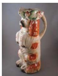
Cat. 98 England, spaniel jug, c. 1865 with later repair made in Zaire. Earthenware with painted clay replacement handle.