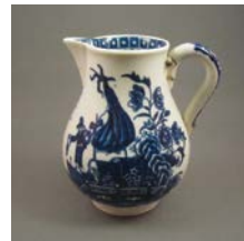
Cat. 51 England, jug, c. 1780 with later alteration. Earthenware, earthenware replacement handle, metal pins.