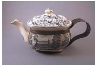
Cat. 119 England, miniature teapot, mid-19th century with recent alteration. Earthenware, metal replacement handle, bands.