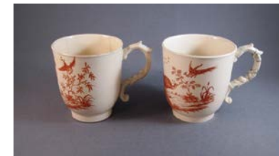
Cat. 84 England, pair of cups, c. 1770s with later alteration. Earthenware, painted metal reinforcements.