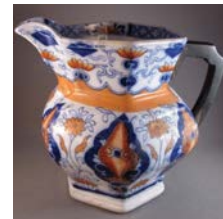
Cat. 61 Mason's Fenton Stone Works (England), jug, early 19th century with later alteration. Ironstone, wood replacement handle with metal mounts.