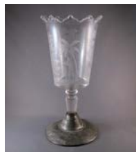
Cat. 122 United States, celery vase, c. 1880s with later alteration. Glass, metal replacement foot.