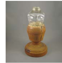
Cat. 129 New England Glass Co. (Massachusetts), oil lamp, c. 1860s with later alteration. Glass, brass, wood replacement base (missing burner).