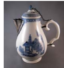
Cat. 46 China for export milk or chocolate jug, c. 1750 with later alteration. Porcelain, replaced and repainted porcelain lid, metal replacement spout, metal rivets, chain.