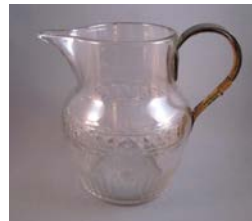
Cat. 71 Probably England, jug, c. 1800 with later alteration. Glass, metal and rattan handle.