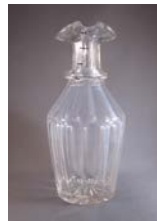
Cat. 72 decanter, c. 1830s with later alteration. Glass, added metal staples.