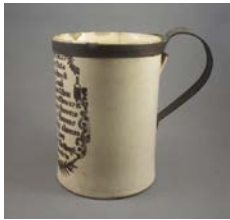
Cat. 89 England, "Farmer's Toast" mug, c. 1800 with later alteration. Earthenware, metal replacement handle, band.