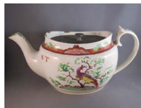
Cat. 28 England, teapot, c. 1790s with later alteration. Porcelain, painted metal replacement lid.