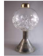
Cat. 128 United States, oil lamp, mid-19th century with later alteration. Glass, brass, metal replacement base (missing burner).