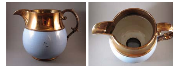
Cat. 63 English, lustre-glazed jug, early 19th century with later alteration. Earthenware, glass patch, putty.