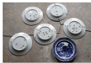
Cat. 6 China for export, set of six plates, c. 1790 with later alteration. Porcelain, added metal staples.