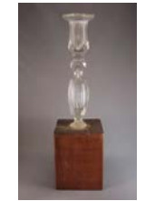
Cat. 130 United States, candlestick, late 19th century with later alteration. Glass, wood replacement base.