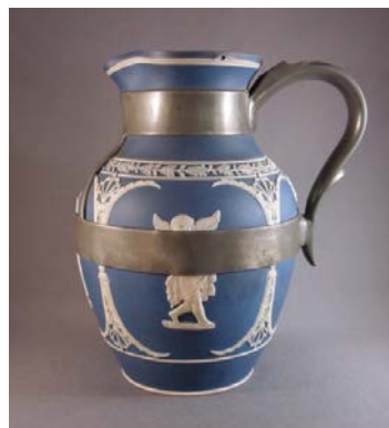
Fig. 9 Dudson (England), jug with angels, c. 1870s with later alteration. Stoneware with pewter replacement handle. Collection of Andrew Baseman

almost defies detection (figs. 5-6). Was it decorated by a hired professional or an owner who was also an amateur “china painter?” The new lid restored the teapot’s beauty as well as its function.