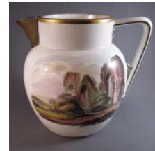
Cat. 58 Swansea (Wales), jug, c. 1810 with later alteration. Porcelain, brass replacement spout.