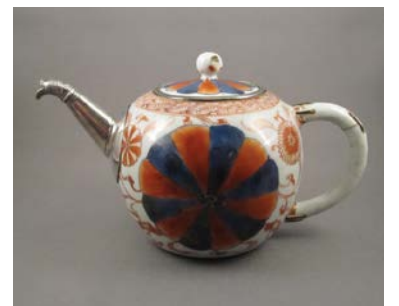
Fig. 24 China for export, teapot, mid-18th century with later alteration. Porcelain with silver replacement spout, band, and metal staples. Collection of Andrew Baseman