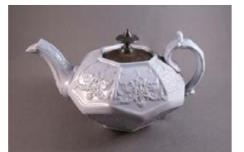
Cat. 41 England, teapot, mid-19th century with later alteration. Stoneware, metal replacement lid.