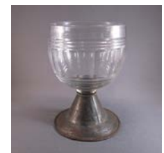
Cat. 109 United States, goblet, c. 1870 with later alteration. Glass, tin replacement foot.