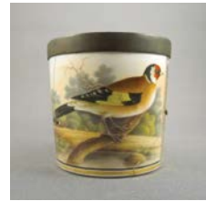
Cat. 116 Worcester (England), inkwell, c. 1810 with later alteration. Porcelain, added copper band, iron staples.