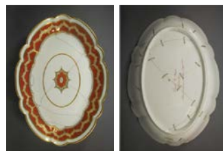
Cat. 8 Flight and Barr (England), dish, c. 1805 with later alteration. Porcelain, added brass staples.