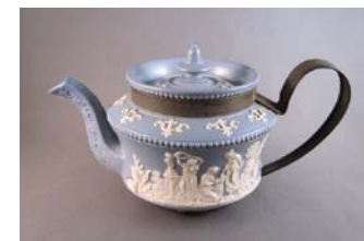
Cat. 40 England, teapot, c. 1840 with later alteration. Stoneware, metal replacement handle, bands.