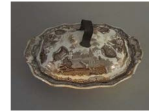
Cat. 11 England, Classical covered dish, c. 1830s with later alteration. Earthenware, iron replacement handle.