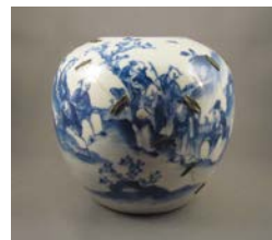
Cat. 123 China for export, jar, c. 1890 with later alteration. Porcelain, added metal staples.