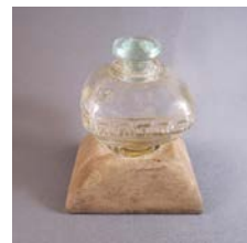
Cat. 124 United States, perfume bottle, c. 1890s with later alterations. Glass, wood replacement foot, replaced glass stopper (recycled).