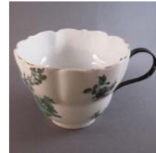
Cat. 82 Meissen Porcelain Manufactory (Germany), cup, c. 1760 with later alteration. Porcelain, bronze replacement handle.