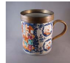
Cat. 81 China for export, mug, c. 1760 with later alteration. Porcelain, brass rim reinforcement, replacement handle, and staple.