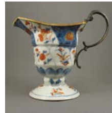
Cat. 45 China for export, jug, mid-18th century with later alteration. Porcelain, metal replacement handle.