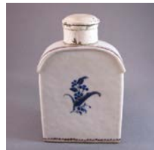
Cat. 50 China for export, tea caddy, late 18th century with later alteration. Porcelain, painted metal replacement lid.