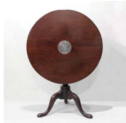
Cat. 134 New York, Tea table, mid-18th century with later alterations. Mahogany with later metal supports, and 1864 silver plaque.