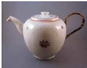
Cat. 26 China for export, teapot, late 18th century with 19th-c. alteration by Edward Coombs (England). Porcelain, rattan and metal handle.