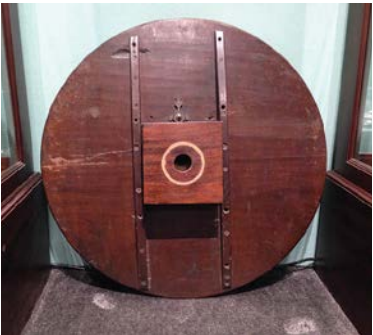
Fig. 17 –18 New York, Tilt-top tea table, c. 1775 with later alteration. Mahogany, secondary woods with added and replacement parts, including a 1864 silver plaque by William Gale and Son (New York).