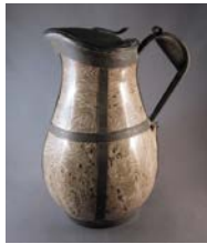
Cat. 68 England, jug, c. 1860s with later alteration. Earthenware, pewter (original lid), metal replacement handle, bands.