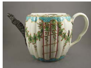
Cat. 29 England, teapot, c. 1770s with later alteration. Porcelain, metal replacement spout.