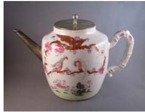
Cat. 23 China for export, teapot, c. 1770s with later alteration. Porcelain, silver replacement spout, metal replacement lid.