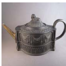
Cat. 30 England, teapot, c. 1790s with later alteration. Stoneware, silver replacement spout.