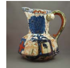
Cat. 57 Davenport (England), jug, c. 1810 with later alteration. Ironstone, added metal staples.