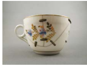
Cat. 90 Minton (England), cup, c. 1802 with later alteration. Bone china, added brass staples.