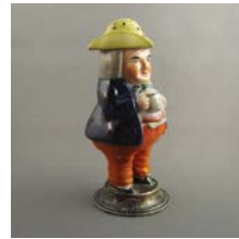
Cat. 70 Earthenware, Toby pepper pot, 19th century with later alteration. Earthenware, silver replacement base.