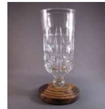
Cat. 104 United States, goblet, c. 1840 with later alteration. Glass, wood replacement foot.