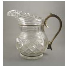
Cat. 73 jug, c. 1836 with later alteration. Glass, silver replacement handle, bands.