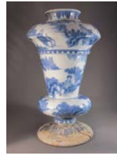
Cat. 113 The Netherlands, vase, c. 1680 with later alteration. Earthenware, painted wood replacement foot.