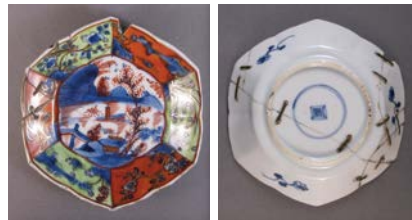
Cat. 3 China for export, "clobbered" saucer, c. 1690 with later alteration. Porcelain, overpainted, added metal staples.